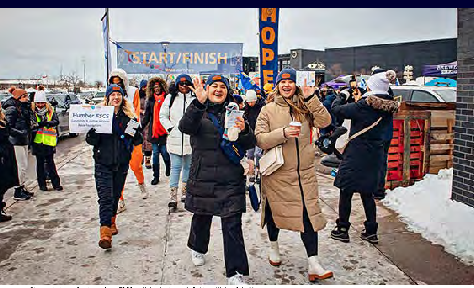
Pictured above: Students from FSCS walk in charity walk Coldest Night of the Year