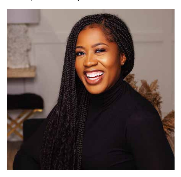
Read online at communityservices.humber.ca/news

Pre-registration is not required. Event is open to all FSCS students, staff and faculty.